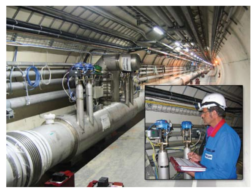
The Large Hadron Collider (LHC) at CERN (European Council for Nuclear Research), Geneva. The LHC is the world's largest, fastest, and coldest accelerator of nuclear particles. Currently, it has over 2,500 Velan bellows seal cryogenic valves installed and controlling the flow of over 700,000 litres of liquid helium.

specification review and quote through to the final inspection prior to shipment. They're also getting more and more complex so it is important that we have a proven track record in performance as well as aftermarket support." Ivan Velan explains further: "If you calculate the range of products we make and the many industries we cover, you can appreciate that there are literally thousands of possible permutations in terms of material selection or specification for an application. It takes experience and real skill to know what works best where, and we're also being constantly challenged as new processes appear — for mineral extraction or in the nuclear world for example."