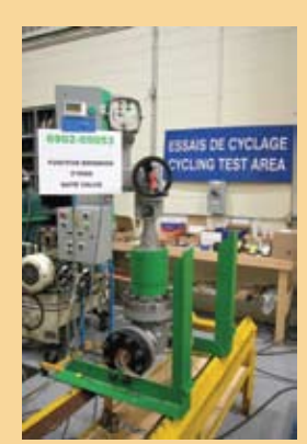
Cycle testing for fugitive emissions today targets 600, 900, and 1500 dass valves.

The challenge has been to have the least amount of emissions at ambient temperatures during thermal cycles. The results we've obtained so far are very encouraging," he concludes.